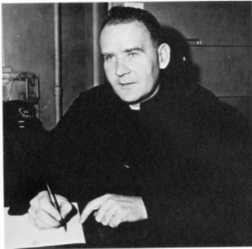
ST. LOUIS COLLEGE VICTORIA, B.C.