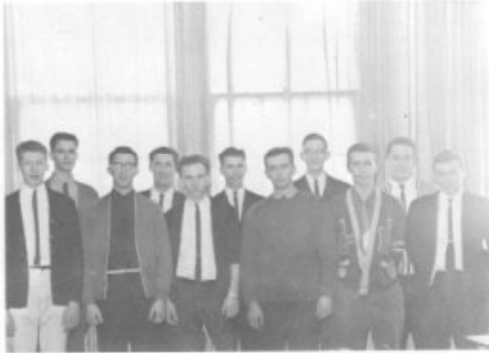
Graduates who have attended St. Louis College since Grade Three.